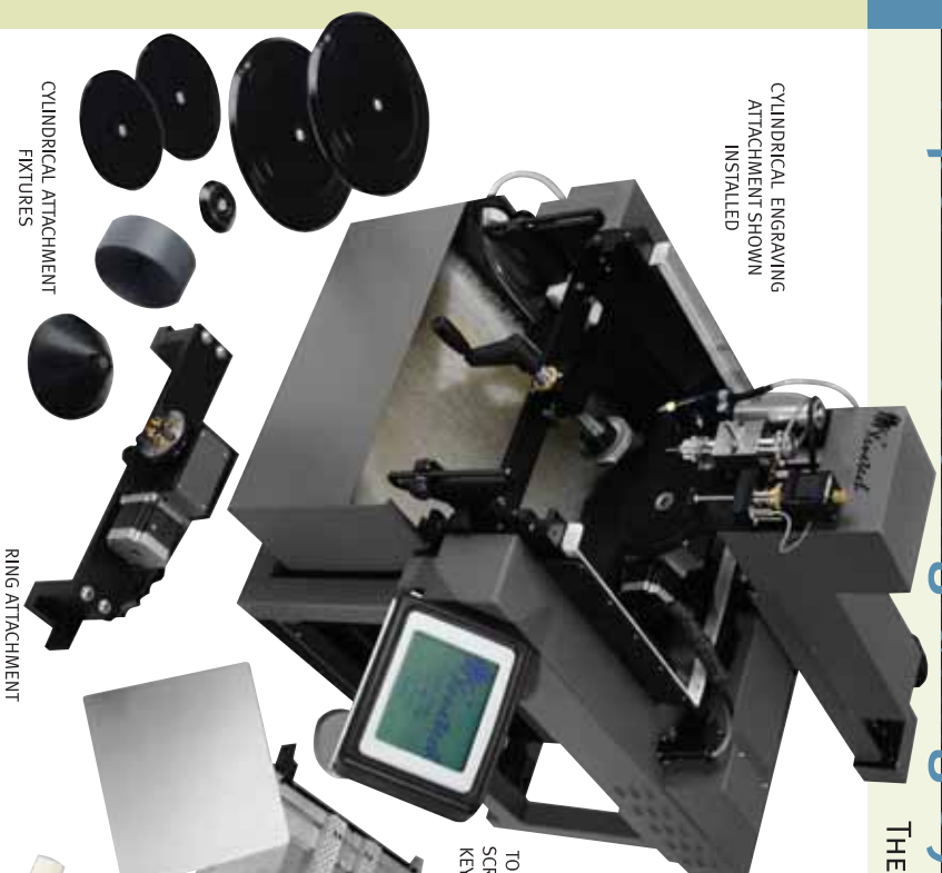
CYLINDRICAL ATTACHMENT FIXTURES